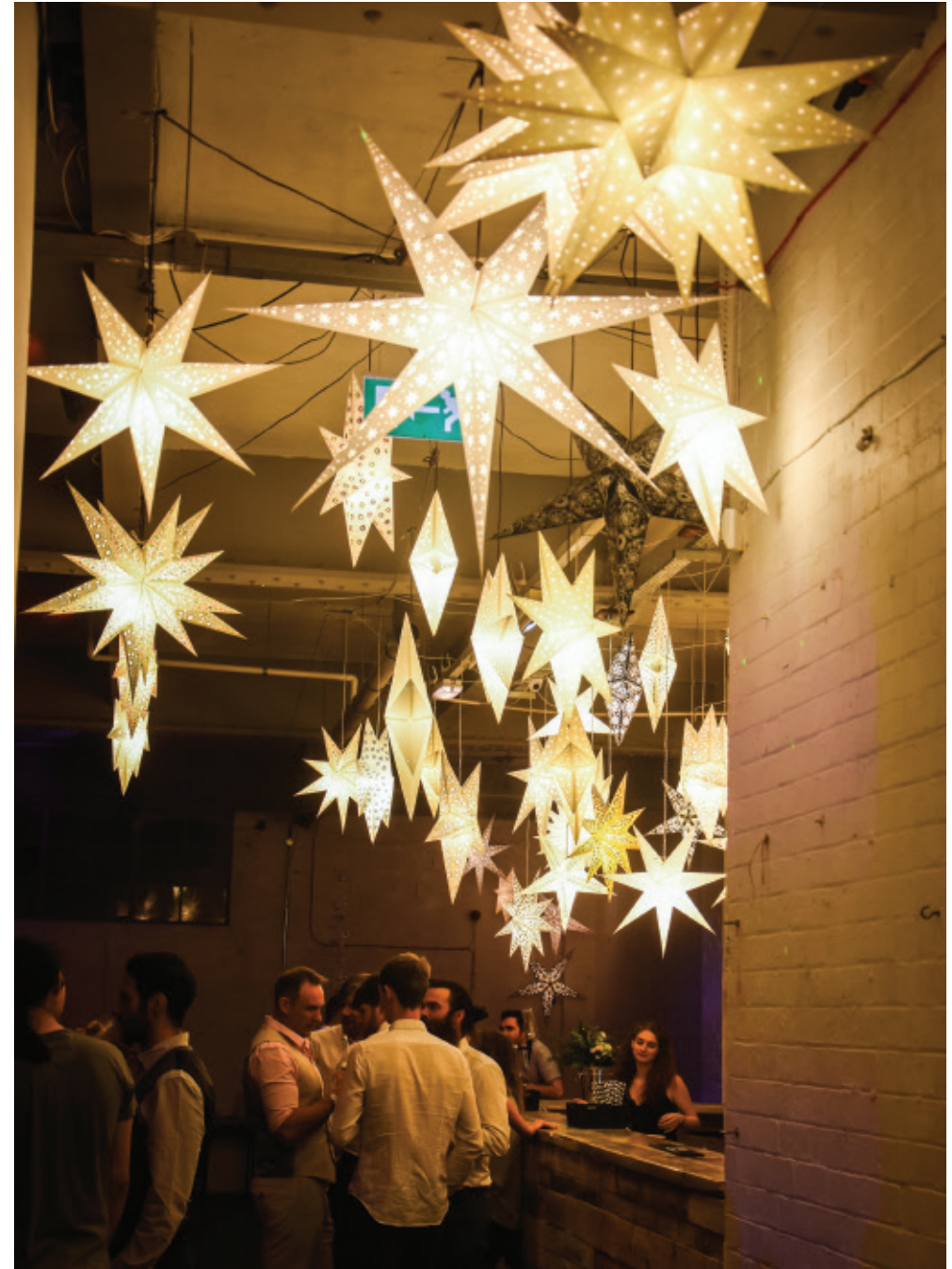
Paper Starlights lanterns, from £16.95, paperstarlights.com