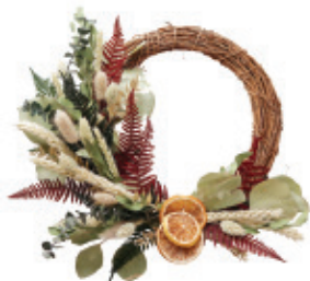
Mary Elizabeth Flowers wreath craft kit, £38, maryelizabethflowers.co.uk