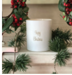
Initially London Ltd monogrammed scented candle, £30, initiallylondon.com

Small changes can make all the difference in reducing our environmental footprint, especially over the festive season when the potential for waste is high. Here are our favourite products to help you be more eco-friendly this Christmas.