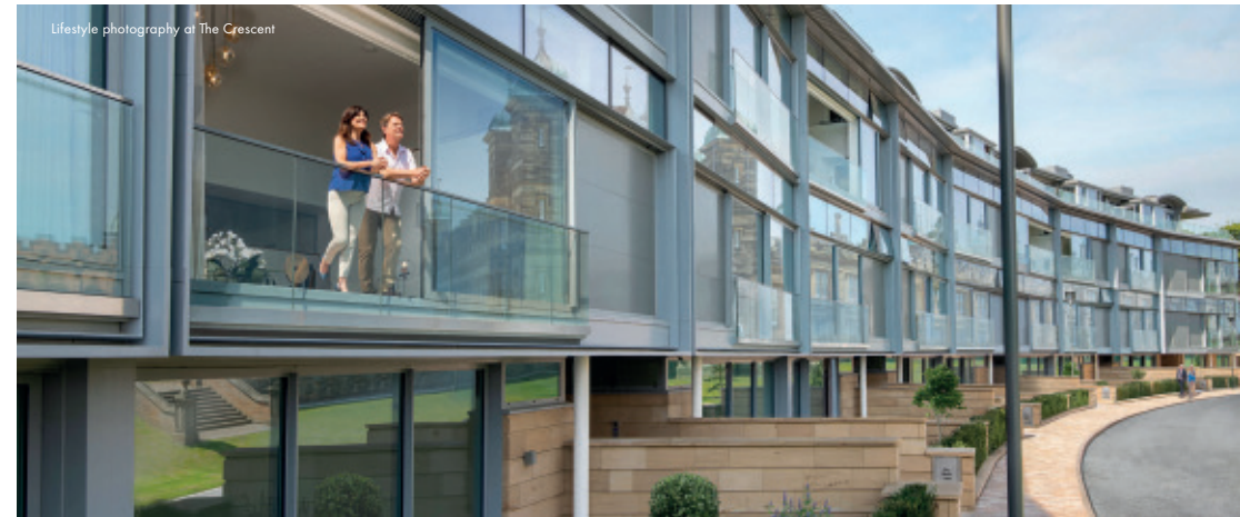
Lifestyle photography at The Crescent