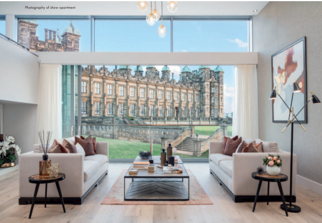
Photography of show apartment