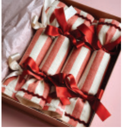
Happy Crackers luxury linen reusable crackers (in Santas Stripes), £30, happycrackers.co.uk