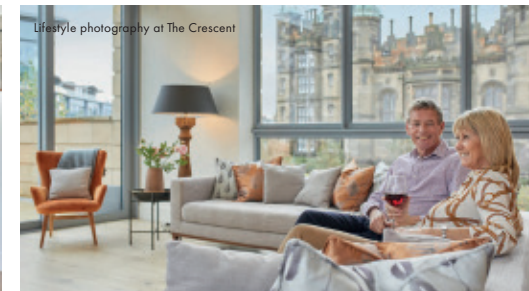
Lifestyle photography at The Crescent

The final homes at this one-of-a-kind development offer the ultimate in open plan living. Enjoying spectacular views of this magnificent 18 acre UNESCO World Heritage location, style is only matched by convenience – thanks to plentiful storage, secure underground parking with EV charging provision, and exceptional specification throughout.