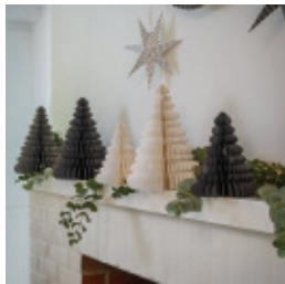
Ella James honeycomb Christmas tree decorations, £28, ellajames.co.uk