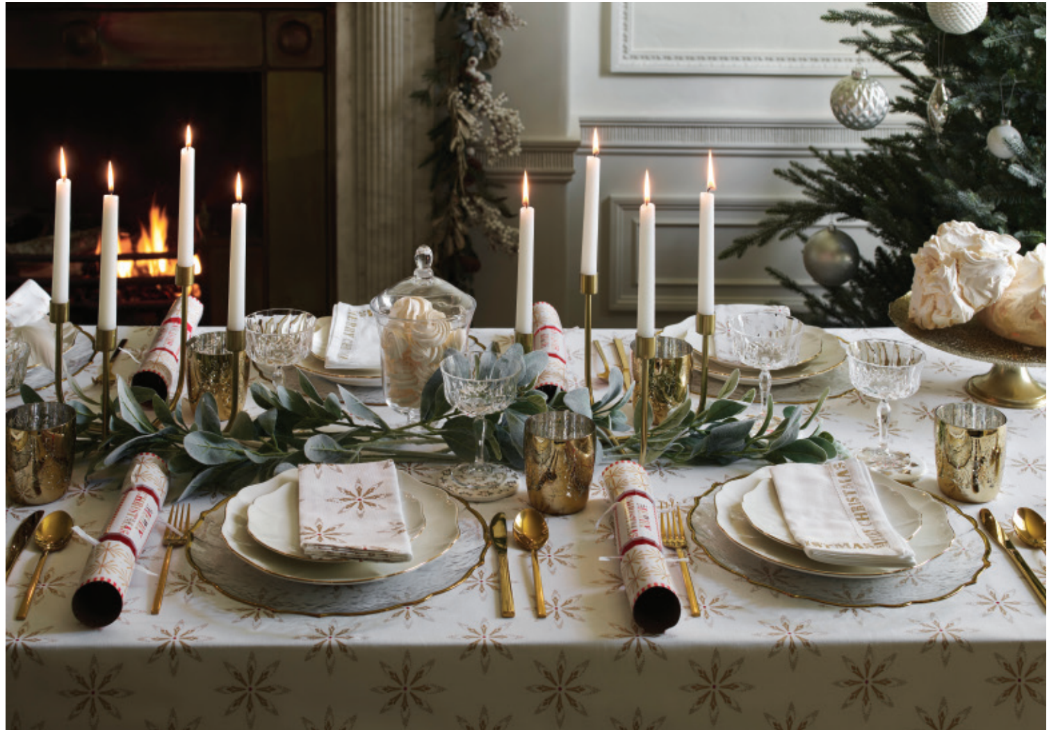
Eucalyptus LED string lights, £10; Fine China Side Plate, 20cm, Gold/White £5; Fine China Dinner Plate, 27cm, Gold/White, £6; Decorative Edge Glass Charger Plate, 30.5cm, £12; Gold Cutlery Set, from £20; Paloma Glass Champagne Saucers, £15; Christmas Holly Glass Tumbler, Gold, £10; Snowflake Cotton Napkins, Set of 4, White/Gold, £14; Snowflake Rectangular Cotton Tablecloth, from £20; Glass Cake Stand, 33cm, Gold, £25

Embrace the festive spirit with our Christmas tableware. Packs of plastic cups are ideal for parties, while mugs decorated with your favourite characters make a great companion to hot chocolates in cold weather. Planning a get-together? Prepare for the big day with sparkly napkins, gold platters and stackable plates to display your favourite dishes – don't forget luxurious coasters to keep your table free from mulled wine stains.