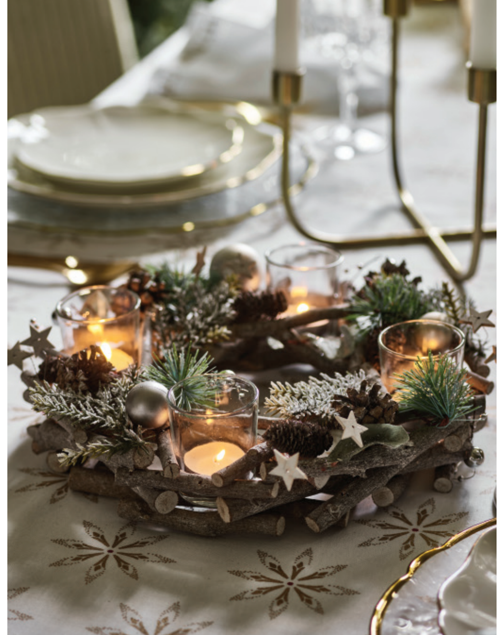
Winter Fayre Merry Christmas Fill Your Own Christmas Crackers, Pack of 6, Multi, £8; Winter Fayre Snowflake Christmas Crackers, Pack of 6, Silver/Gold, £35; Christmas Fine China Coasters, £15; Merry Christmas Cotton Napkins, Set of 4, £20

Find everything you need for an unforgettable season at John Lewis & Partners. Shop in-store or online at johnlewis.com .