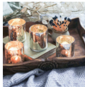
Paper High silver antique effect tea light holders, £19.95, paperhigh.com