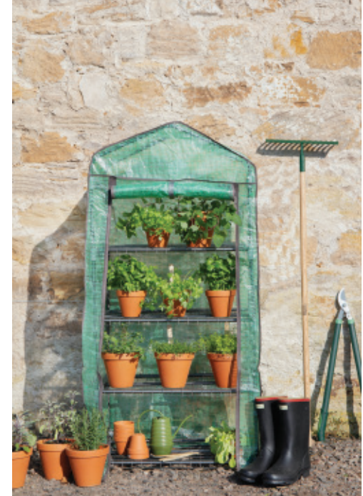
Classic 4 Tier GroZone £34.99

Although a lot of people might think that winter is a time for garden shut down, Marcus says there are still plenty of options for those who want to do some planting. Winter-flowering violas and pansies can be planted through the autumn and winter and will survive the cold