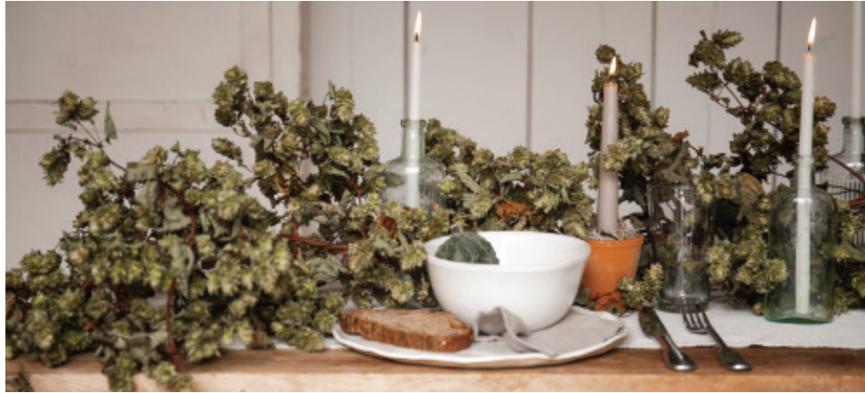
The Interiors Yard vintage medicine bottles, from £16, theinteriorsyard.co.uk