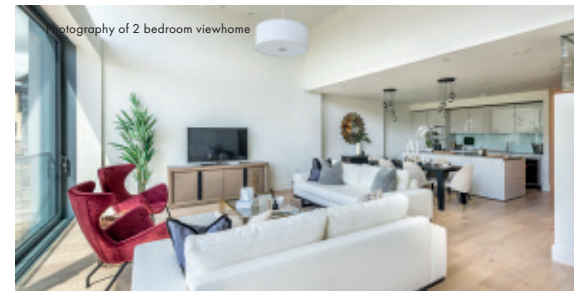
Photography of 2 bedroom viewhome